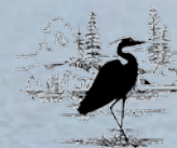
UPPER RIDEAU LAKE ASSOCIATION